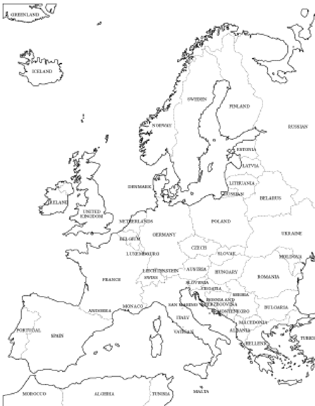
Figure 4.1: Europe (This map was obtained from http://english.freemap.jp/index.html 3 and is used with permission under a Creative Commons Attribution 3.0 license 4 .)