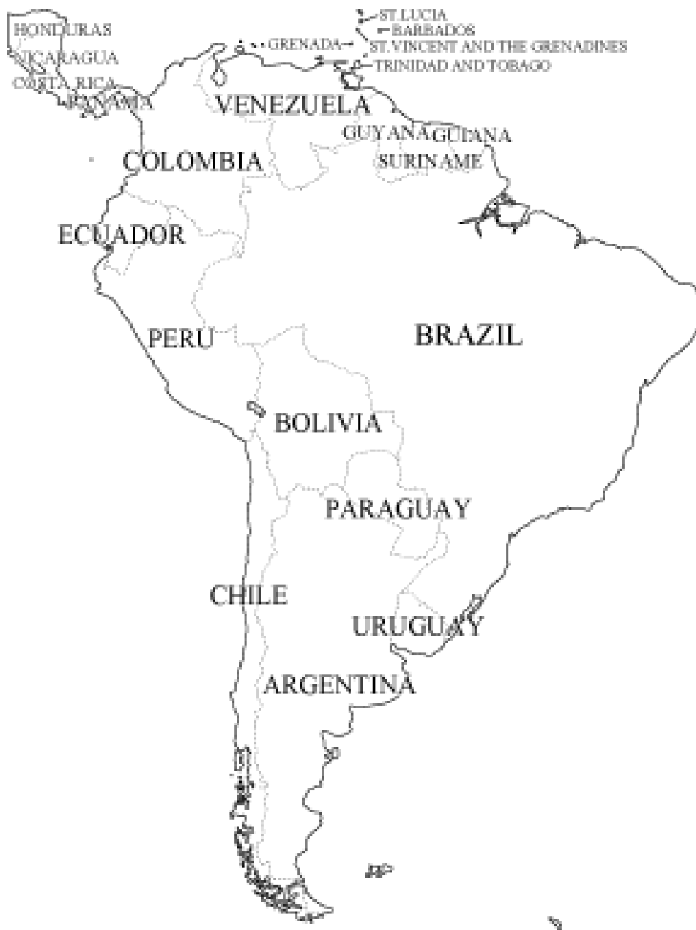
Figure 2.2: Mexico, Central America, the Caribbean, and South America (This map was obtained from http://english.freemap.jp/index.html 5 and is used with permission under a Creative Commons Attribution 3.0 license 6 .)