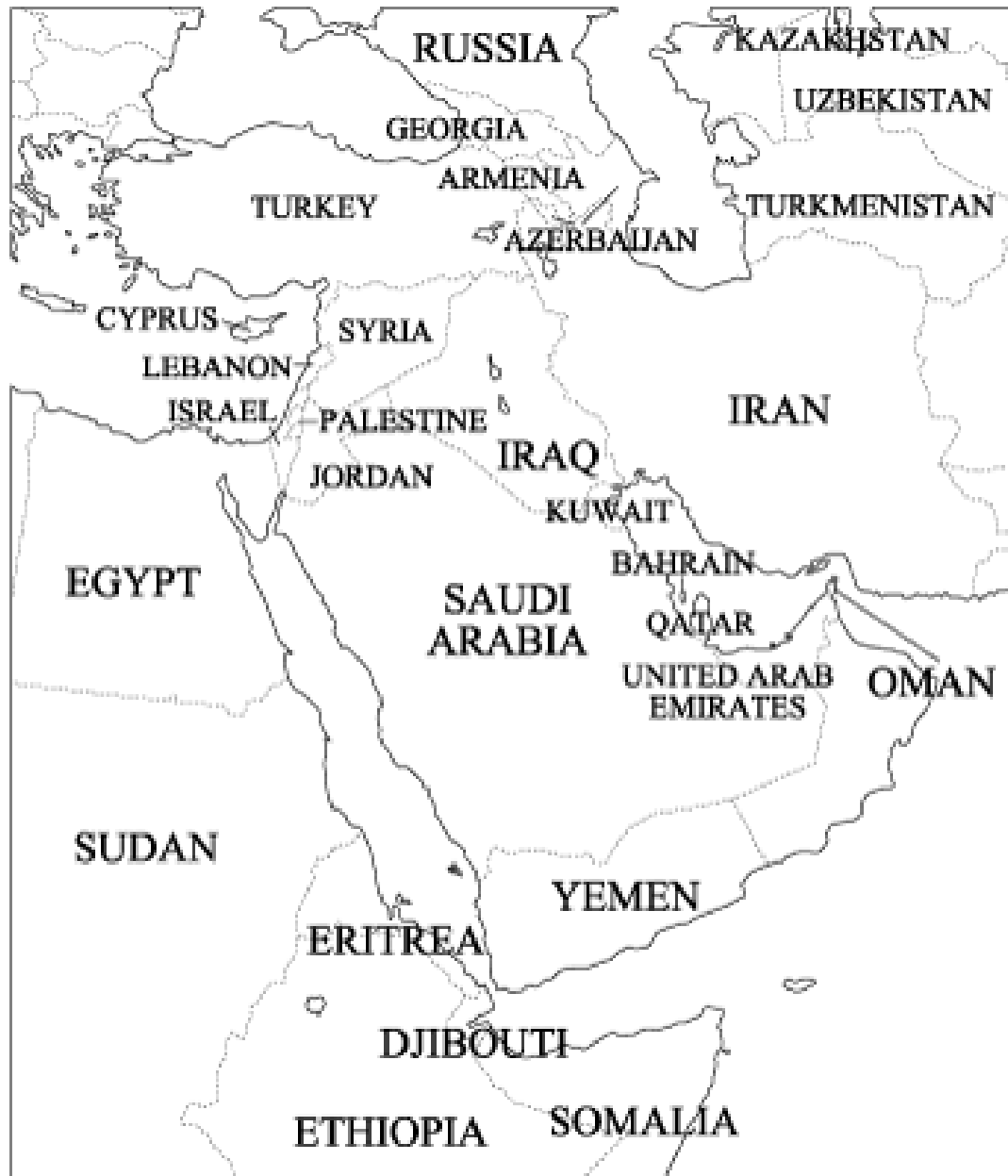
Figure 7.1: The Near East (This map was obtained from http://english.freemap.jp/index.html 3 and is used with permission under a Creative Commons Attribution 3.0 license 4 .)

The Anatolian peninsula, currently represented chiefly by the country of Turkey, historically has been a land of many different nations and peoples. In the eastern end, the ancient country of Armenia has been now absorbed mainly by the Soviet Union but we are keeping this district of ancient Armenia as a separate entity in this work.