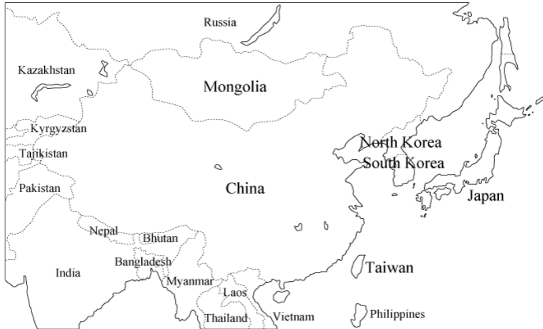
Figure 6.1: The Far East

In certain time-frames in the manuscript this region will be further divided into [1] Mainland Southeast Asia and [2] Indonesia and adjacent islands. The latter classification will include the Philippines. The boundaries and peoples of mainland Southeast Asia are and have always been confusing. On the map, the current situation is indicated. Burma is shown with oblique lines while Vietnam has horizontal stripes. Cambodia is cross-hatched, while Laos is essentially black. Other countries are quite well labeled. The area listed as Siam is, of course, currently called Thailand.