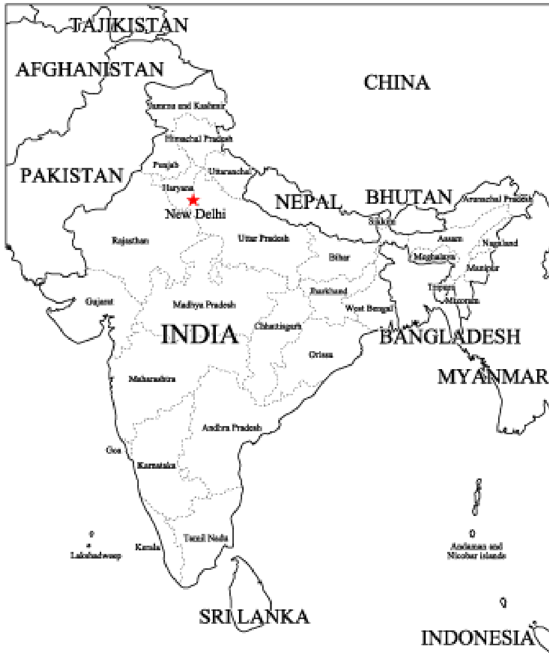
Figure 5.1: Indian Subcontinent This map was obtained from http://english.freemap.jp/index.html 3 and is used with permission under a Creative Commons Attribution 3.0 license 4 .)